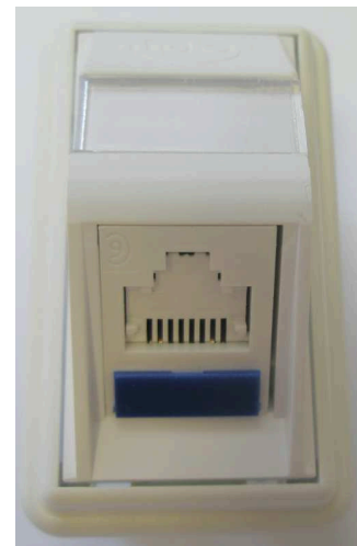
Front of module And collar)

Single latch at bottom of Euromod II module